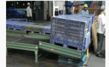
Ergonomic equipment for increased productivity and worker safety!