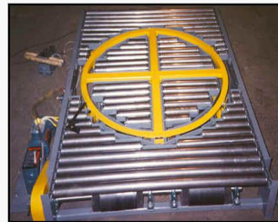
ACSF can solve all your unique product orientation requirements!