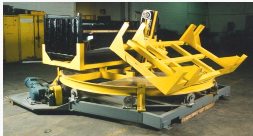
Specialty material handling turn/tilt table increases production while solving ergonomic challenges