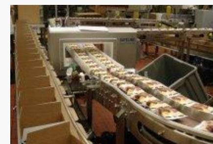
Table top chain conveyors with metal detection for the food and drug industries