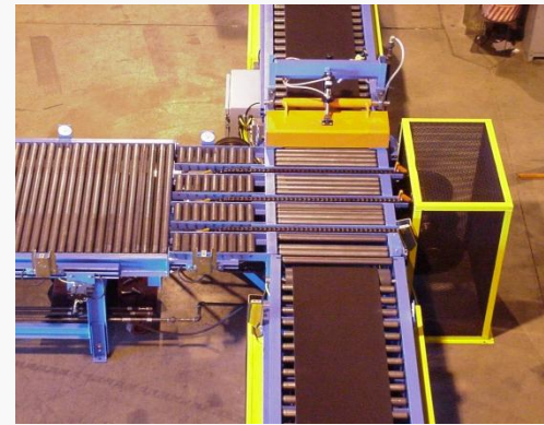
90 Degree 3 strand lug transfer, Belt driven live roller conveyor, Roller bed belt conveyor with Pneumatically actuated diverter.