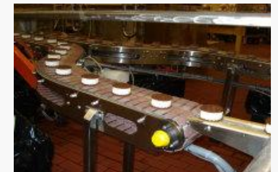
Stainless steel "wash-down duty" table top conveyor for frozen foods