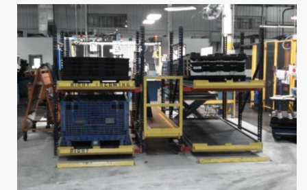
Gravity over/under conveyor system to maximize storage and space requirements