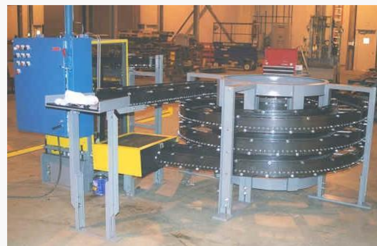
Part storage silo, part escapement and elevator