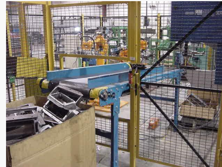
Robotic Cells with Infeed and Discharge Conveyors including interlocking safety fencing