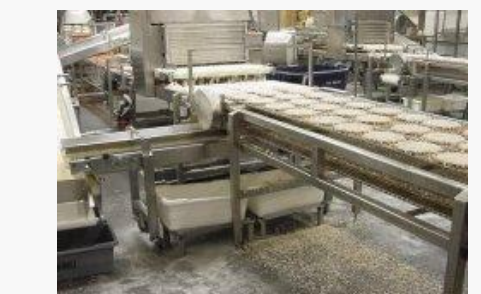
Sanitary belt conveyors for raw food products