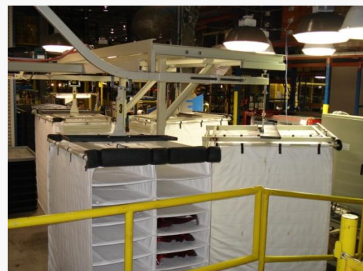
Overhead powered chain conveyor w/part handling baskets.