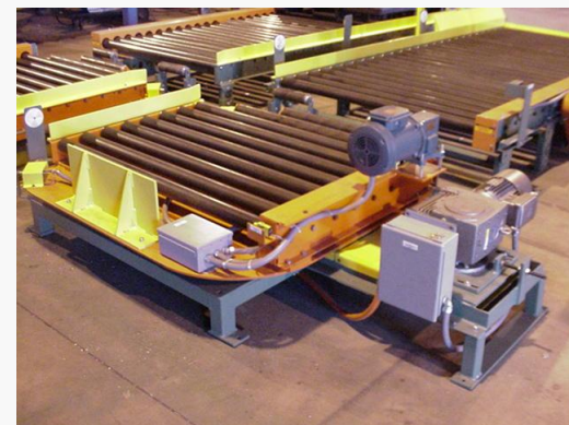
Pallet handling / Indexing