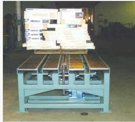
4 lane gravity conveyor with pop-up drag chain for zone accumulation