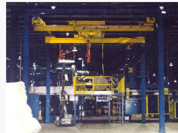
Flatboard processing system w/ smart crane technology